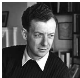
Benjamin Britten Born in Lowestoft, England, November 22, 1913 Died in Aldeburgh, December 4, 1976

Benjamin Britten numbers among a select company of composers who mastered both dramatic and non-dramatic music. Rossini, Wagner, Verdi, Puccini, and others devoted their careers primarily to opera while figures such as Beethoven, Schumann, Brahms, and Mahler either shunned theatrical music entirely or essayed a lone opera. Mozart was perhaps the one who best did it all and Britten was a rare 20th-century example. He composed a dozen operas, with Peter Grimes his first full-scale one and his most famous. The advantage of writing across various genres is that a composer can learn from experience, bringing, for instance, dramatic elements into an instrumental work or enriching an opera with an abstract formal technique, such as the Passacaglia from Peter Grimes we hear tonight.