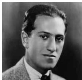
George Gershwin Born in Brooklyn, New York, September 26, 1898 Died in Hollywood, California, July 11, 1937

By 1920 the fabulously successful George Gershwin had begun to contemplate venturing further into the realm of concert music, remarking, "Operettas that represent the life and spirit of this country are decidedly my aim. After that may come opera, but I want all my work to have the one element of appealing to the great majority of our people." In 1922 he experimented with the creation of a concise, one-act "jazz opera," Blue Monday Blues . This attractive and lively score only whetted the appetite of Gershwin's legion of admirers for a full-length opera. Two years later he composed his great "crossover" hit, the Rhapsody in Blue for piano and jazz band.